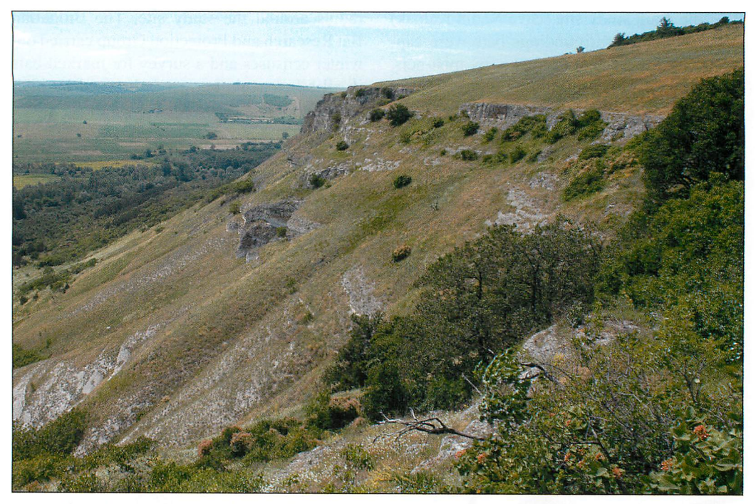
Fig. 5. Typical aspect in the North of Bulgaria: the prebalkan hills form a karstic landscape. The land use of plain and the plateau is dominated by an intensive agriculture, while the slopes were used for grazing sheep and goates until recently. - Typische Landschaft im bulgarischen Donauhügelland mit aus Kreidekalken aufgebauter Karstlandschaft. Die Ebenen und Hochflächen werden intensiv landwirtschaftlich genutzt, die mageren Hangbereich dienten bis vor wenigen Jahren als Weideflächen.

Field work was carried out under licence of the responsible Bulgarian authorities (15-RD-08/15.01.2001, 48-00-56/16.01.2001, 8/02.07.2004 RIOSV Pleven, RIOSV Ruse).