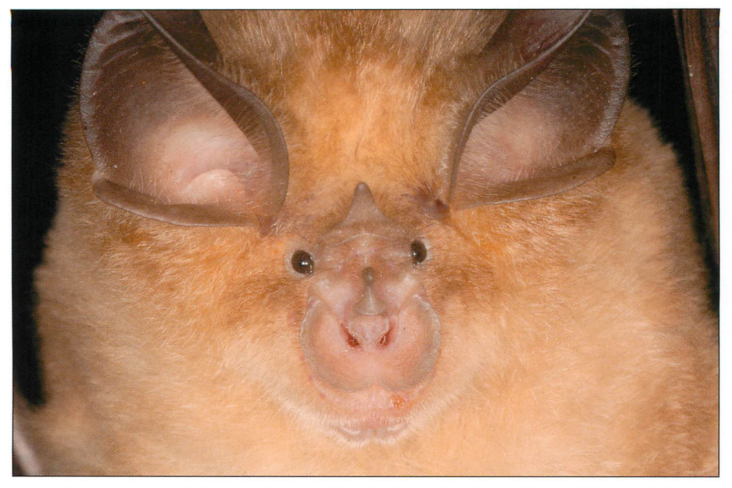
Fig. 3. Portrait of a Mediterranean Horseshoe Bat ( Rhinolophus euryale ). -Porträt einer Mittelmeer-Hufeisennase ( Rhinolophus euryale ).