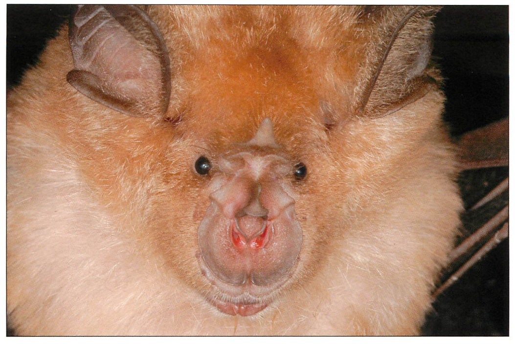
Fig. 1. Portrait of a several years old Greater Horseshoe Bat ( Rhinolophus ferrumequinum ). - Porträt einer mehrjährigen Großhufeisennase ( Rhinolophus ferrumequinum ).