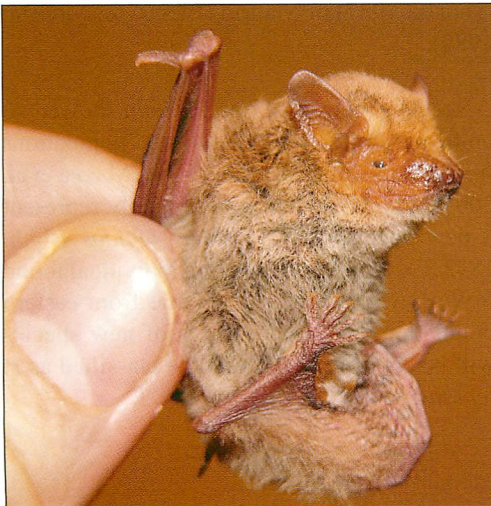
Fig. 1. Portrait of Pipistrellus kuhlii in the found individual.

Thus the Warsaw record is chronologically the first finding of this species in Poland and the northernmost locality on the continent (SACHANOWICZ et al. 2006). The distance from the nearest known site is remarkable: ca. 240 km