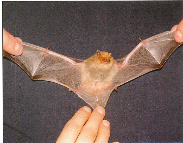
Fig. 2. Colouration of the head, edge of patagium and tail membrane in the found individual of Pipistrellus kuhlii .